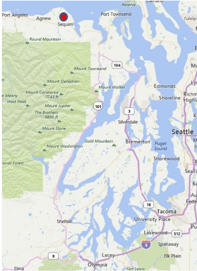
MAP OF SHORT COURSE LOCATION:

REGISTRATION: Please register by January 30 2018, by sending an email with your name, organization and title (if applicable) and the location of the short course you wish to attend to shortcourse@commerce.wa.gov or by leaving the same information at 360 725-3064. Registration is not required, but helps for planning purposes; all will be welcome at the event. There is no cost to attend. SEE ALL UPCOMING IN PERSON COURSES AND VIDEO OPTIONS ON THE SHORT COURSE WEB PAGE AT: www.commerce.wa.gov/serving-communities/growth-management/short-course/